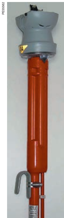
2 - Pushing the unit onto the line