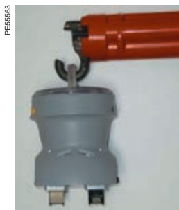
1 - Fixing the unit on the hook